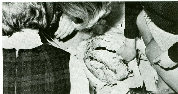
Eager hands grabbed for candy from the broken pinata.