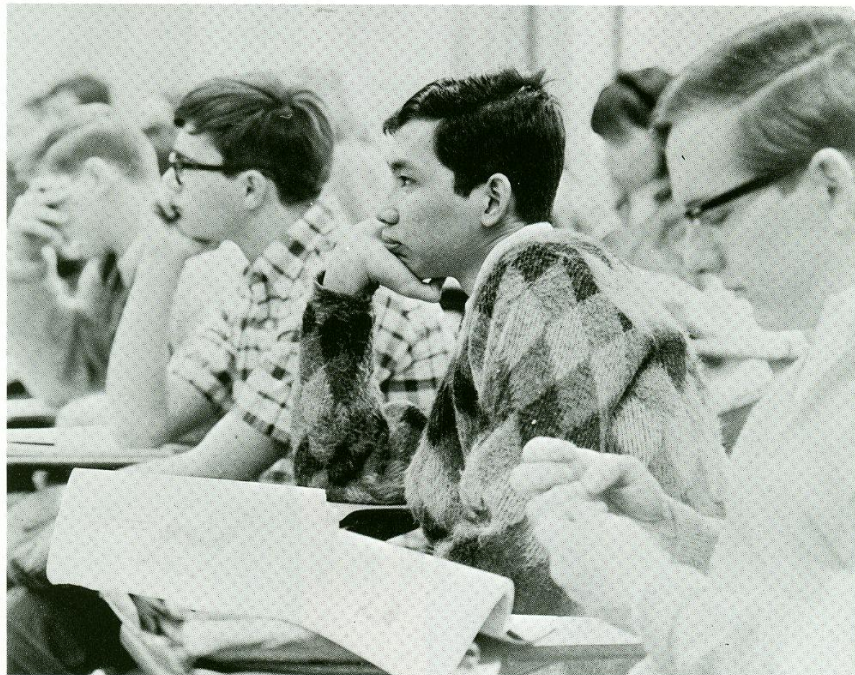
Social Problems—Where ignorance is Bliss.

History and sociology classes, discussing various problems and philosophies of life, past, present, and future, help the student to better understand the complicated world in which he lives.