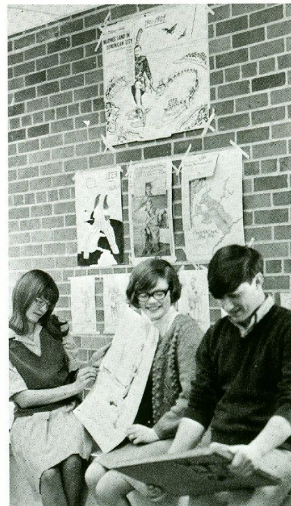
American History encompasses all phases of life.